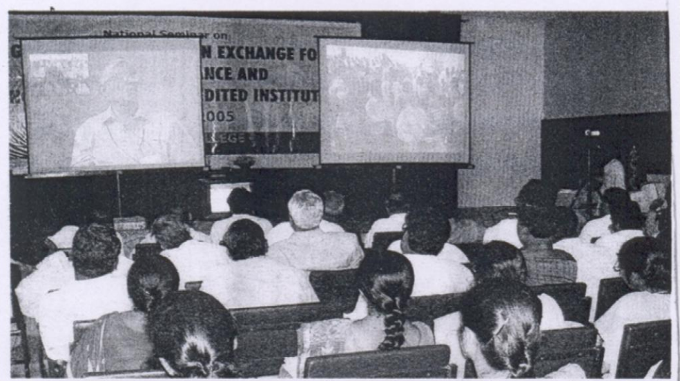
Exploring digital avenues to enrich knowledge. Students at a seminar at St. Joseph's College, Tiruchi.