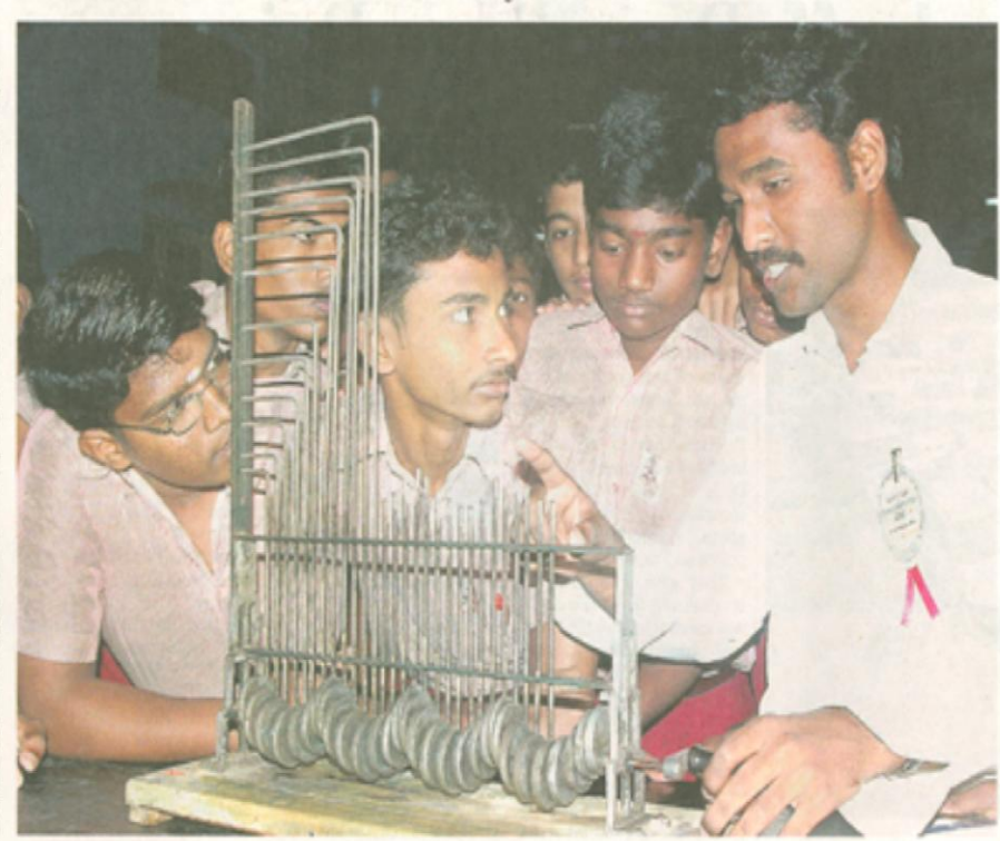
COMPREHENDING CONCEPTS: Participant explaining a point to school students during the science exhibition at St. Joseph's College in Tiruchi on Friday.

There are a total of 350 exhibits. As many as 5,000 students from 21 schools in the districts of Tiruchi and Karur