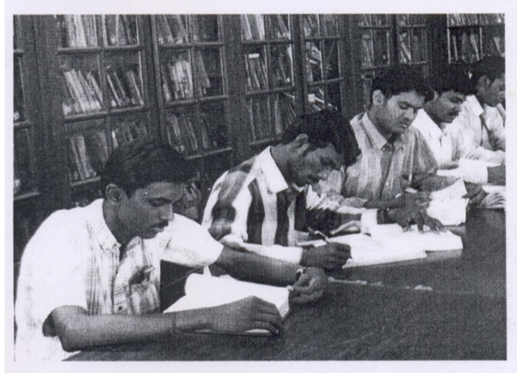
BOOK SEARCH MADE EASY: Students browsing through books at St. Joseph's College Library, where the Online Public Access Cataloguing System was launched recently.