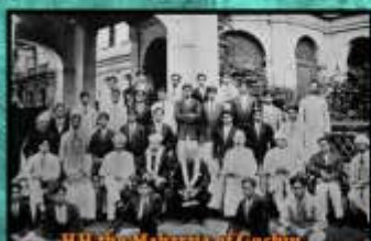
H.H. the Maharaja of Cochin & the Cochin Catholics