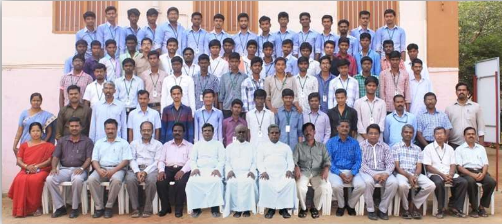
M.Sc. Maths (Shift-I) (2013-15)