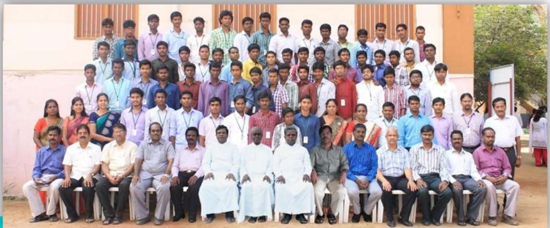
BA English (Shift-I) (2012-15)