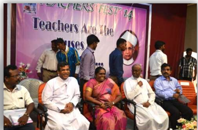
Teachers' Day Celebration - Shift-II