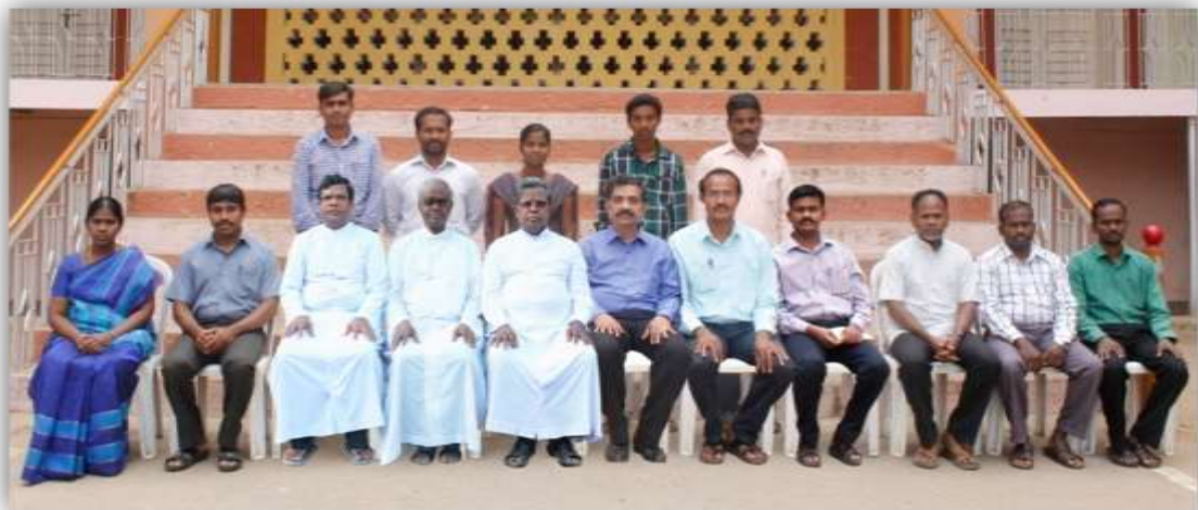
M.A. History (2012-14)