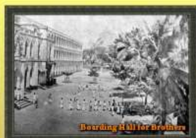
Boarding Hall for Brothers