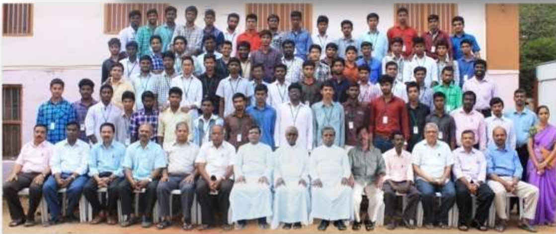
B.Sc. C S (Shift I) (2012-15)