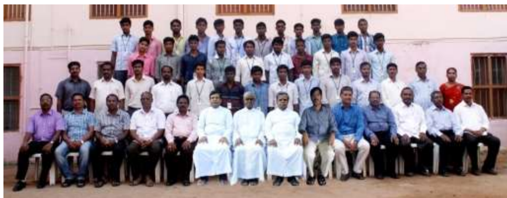
B.Sc. Chemistry Sec.A (2012-15)