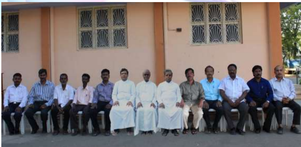
Heads of the Department & Coordinators - Shift-II