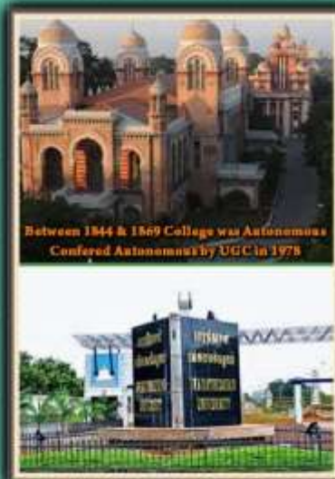
Between 1844 & 1869 College was Autonomous. Conferred Autonomous by UGC in 1978