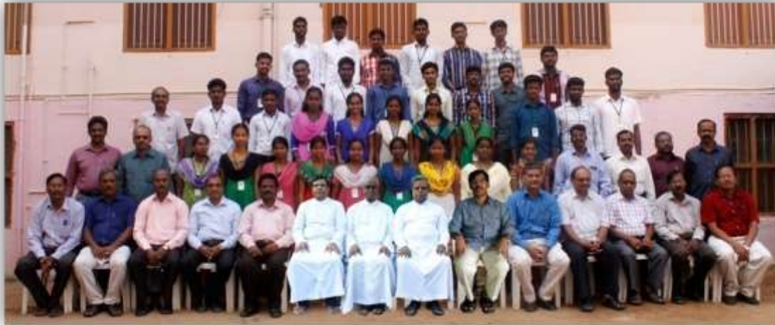
M.Sc. Phys. - Shift-I (2013-15)