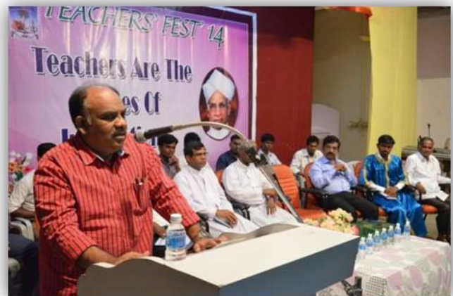
Teachers' Day Celebration - Shift-I