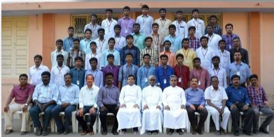
B.Com. 'A' (Shift-II) (2012-15)