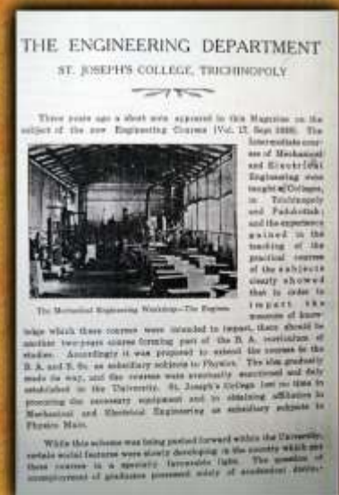
1928 - Mechanical and Electrical Engineering courses were introduced.