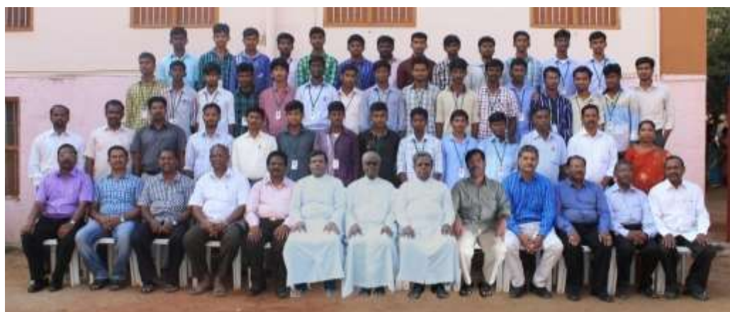
B.Sc. Chemistry Sec.B (2012-15)