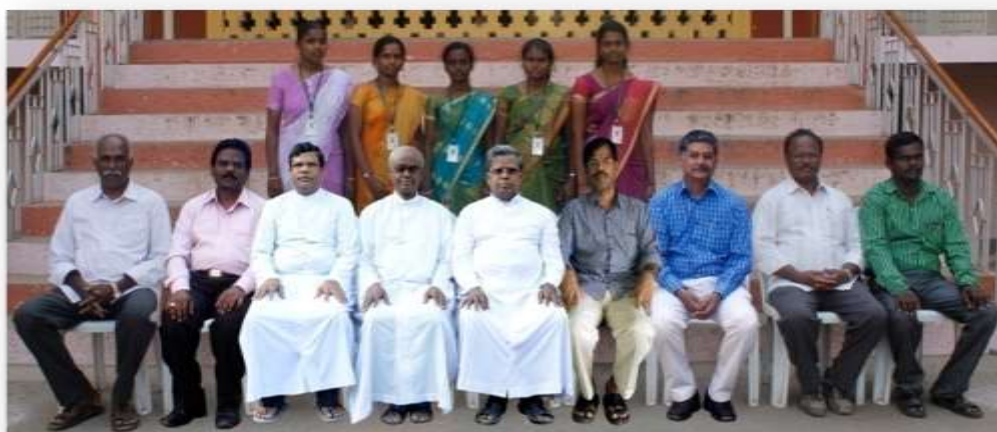
M.Phil. Statistics (2014-15)