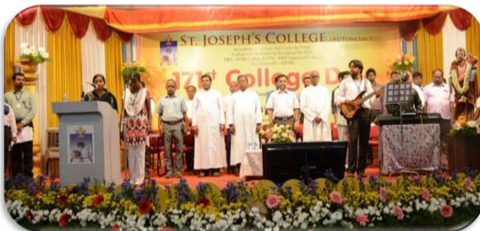
College Day function begins with inspiring prayer song