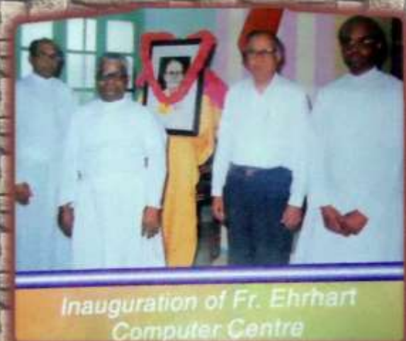
1998 - Library computerized information service, Internet facility were introduced.