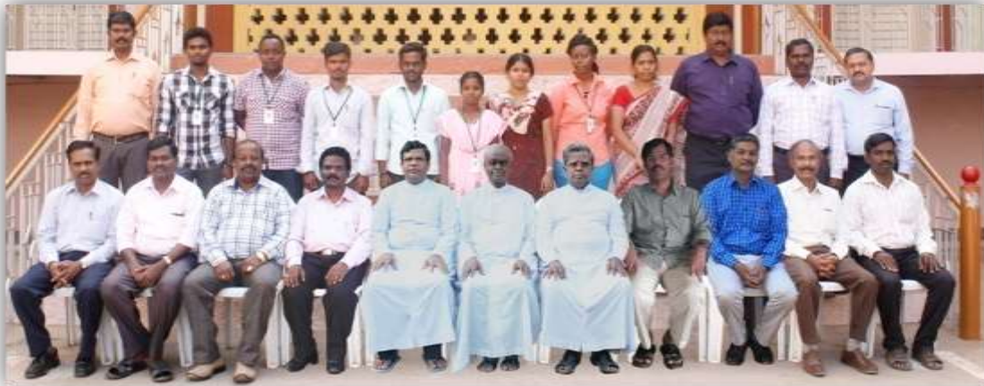
M.Phil. Economics (2014-15)