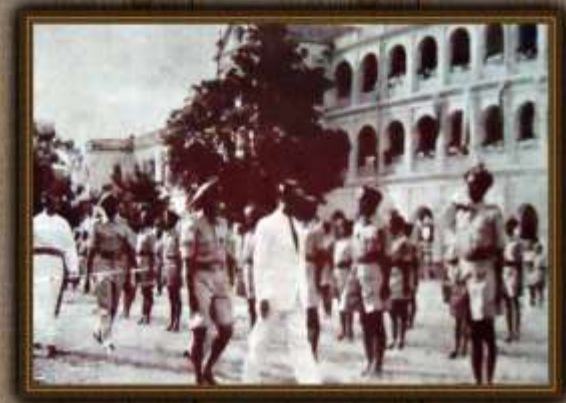
1905 - The Lawley Hall was opened by the Governor of Madras, Sir Arthur Lawley.