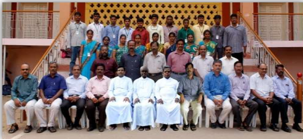
M.Phil. Physics (2014-15)