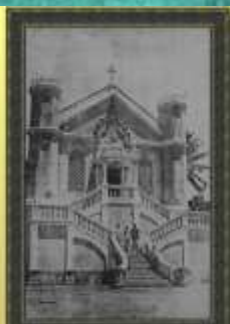
Old appearance of Museum - Front view