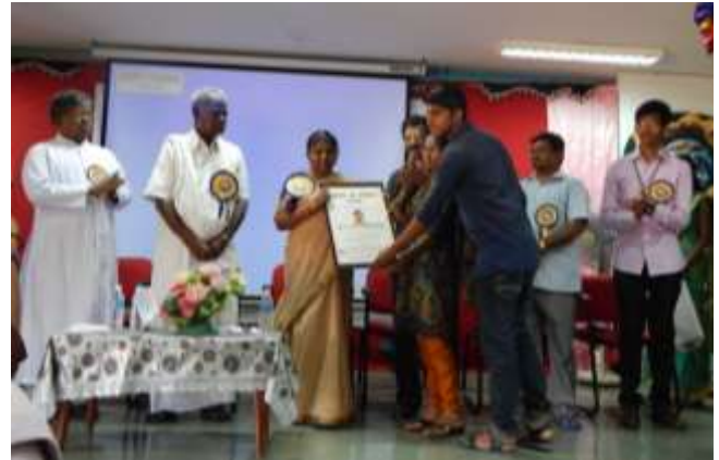
A Special talk on "Role of Youth in Liqour Free India" by Mr. Vaiko, Secretary General of MDMK and social reformer was delivered.