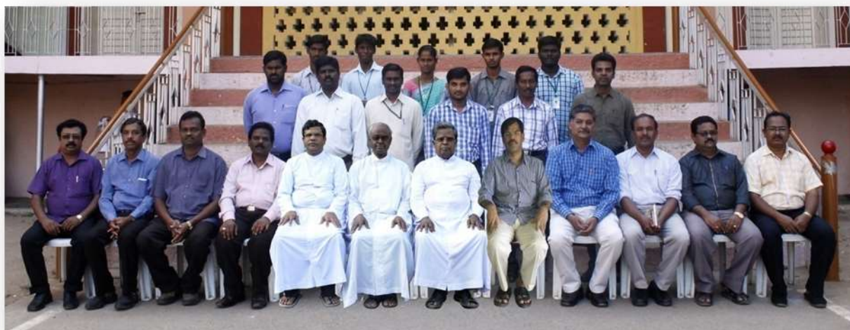
B.Sc. Botany (2012-15)