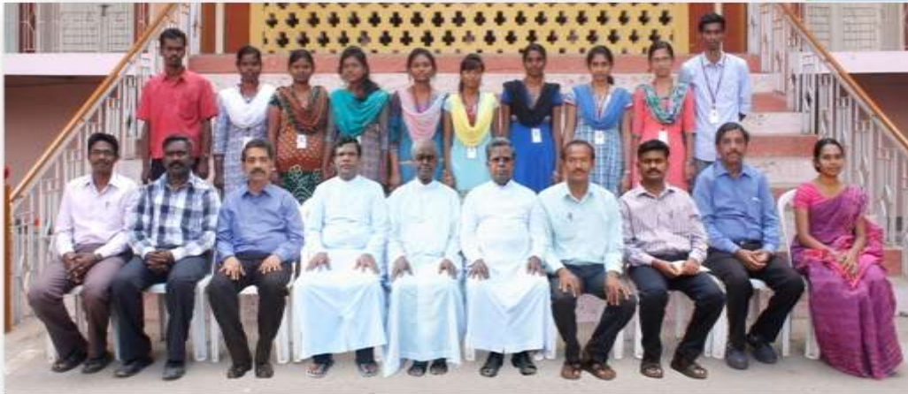
M.Sc. Biotechnology (2013-15)