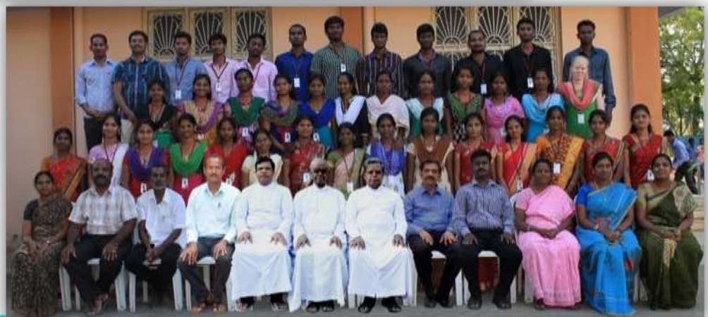
B.Sc. Maths 'B' (2012-15)