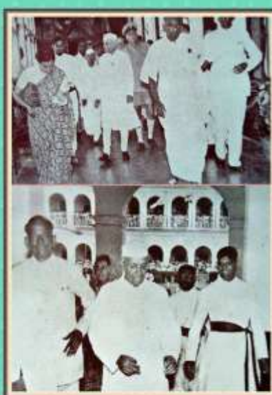
1955 - Hon'ble Prime Minister Shri Pandit Jawaharlal Nehru visited the campus.