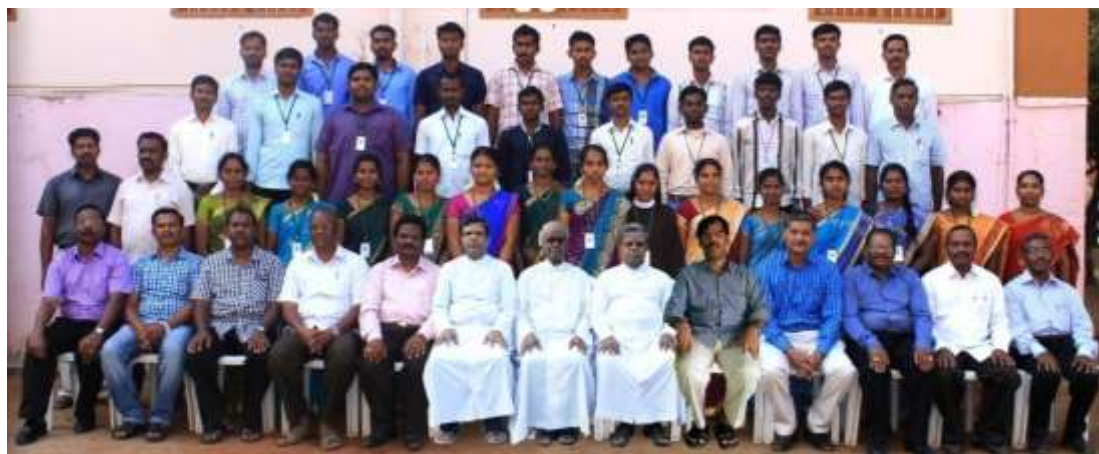
M.Sc. Chemistry Shift-I (2013-15)