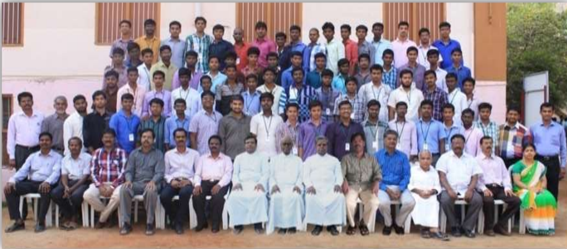
B.Com. 'A' (Shift-I) (2012-15)