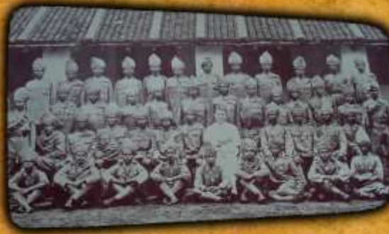
1918 - Old Boys Association was inaugurated.