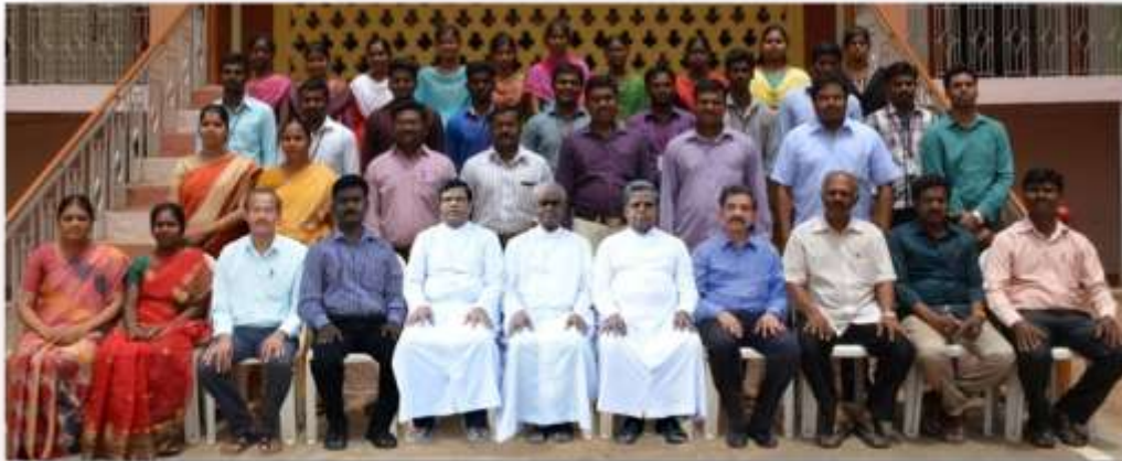
M.Sc. IT (Shift-II) (2013-15)