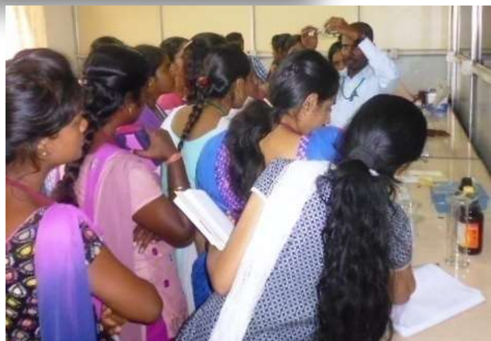
UGC sponsored - Hands on Training