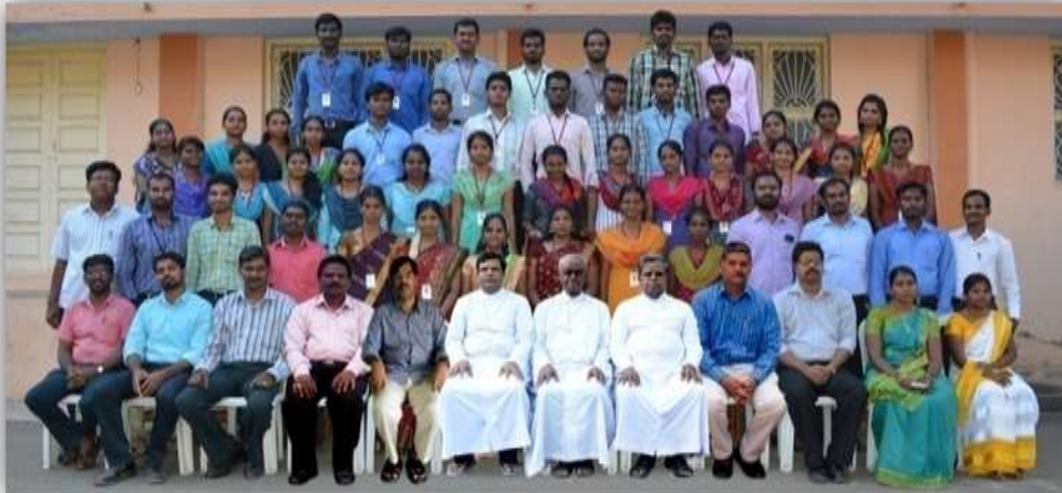
MA English (Shift-I) (2013-15)