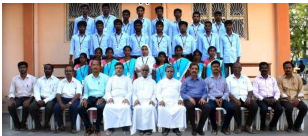
M.Sc. Chemistry Shift-II (2013-15)