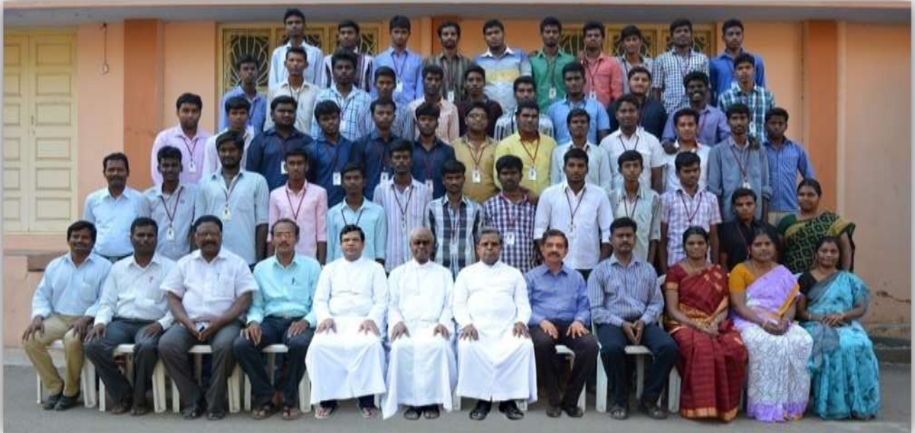
BBA 'A' (2012-15)