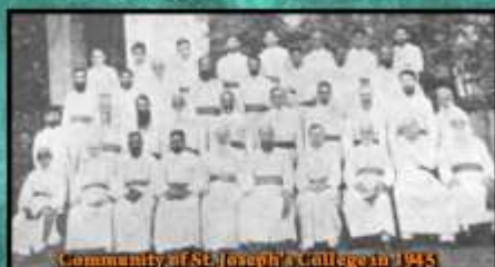
Community of St. Joseph's College in 1945