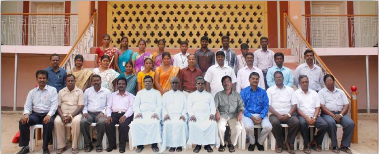
M.Phil. Tamil (2014-15)