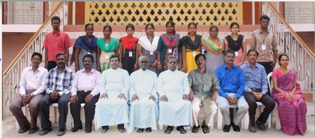
M.Phil. Biotechnology (2014-15)