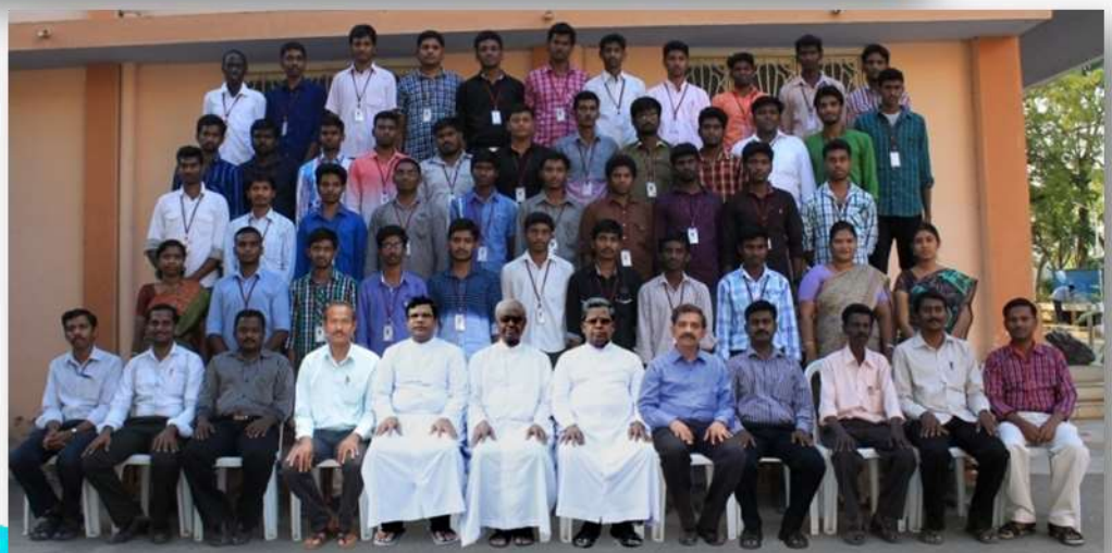
B.Sc. CS (Shift II) (2012-15)