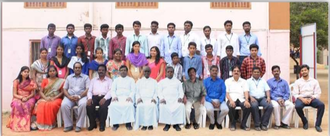
Communication Club (2014-15)