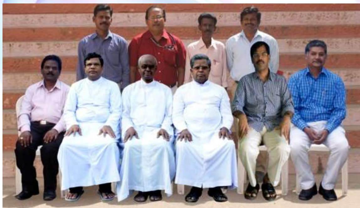
Training and Placement Cell