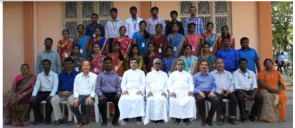
M.Sc. Phys. - Shift-II (2013-15)