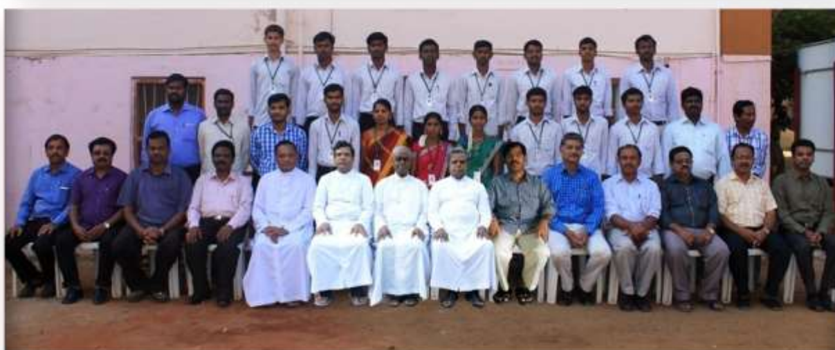
M.Sc. Botany (2013-15)