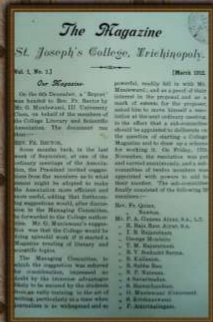
1913 - The First College Magazine.