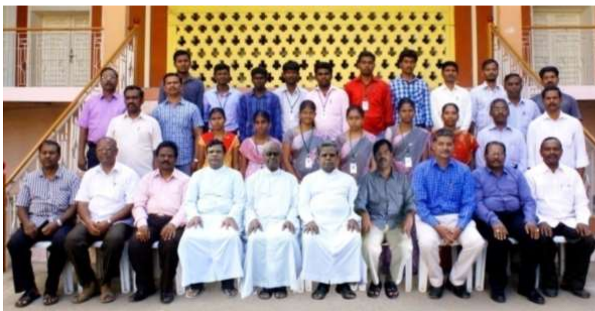
M.Phil. Chemistry (2014-15)