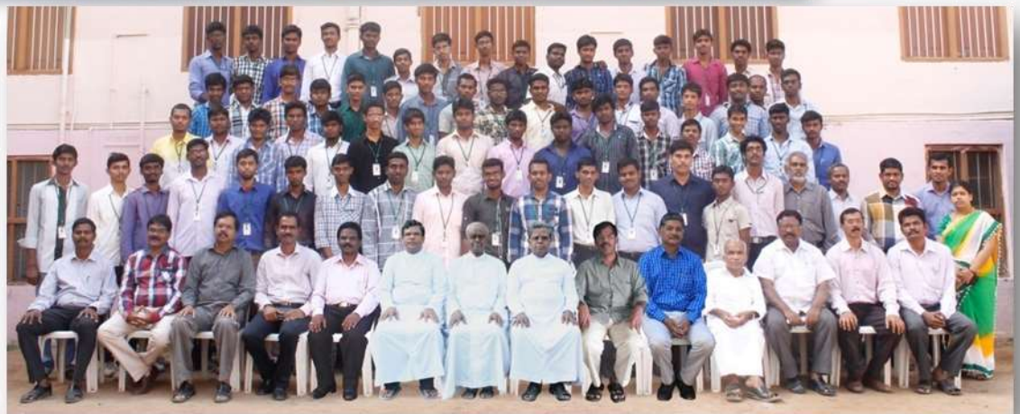
B.Com. 'B' (Shift-I) (2012-15)