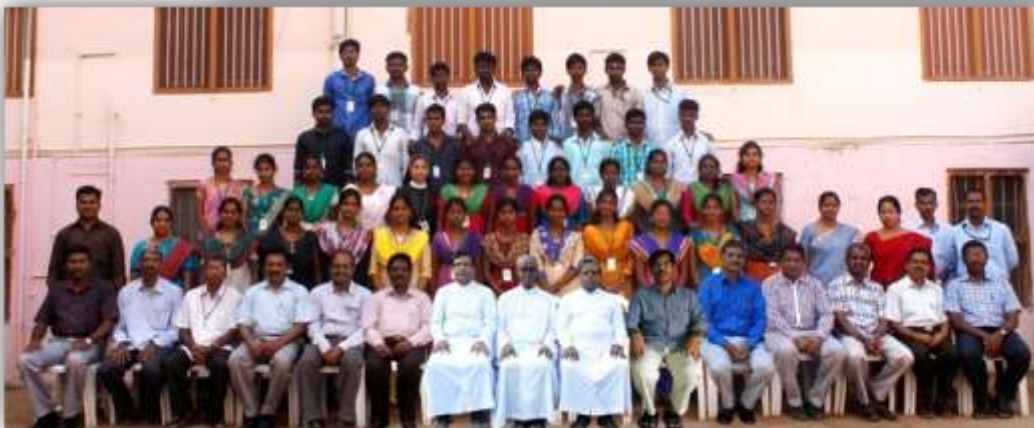
B.Sc. Maths 'A' (2012-15)