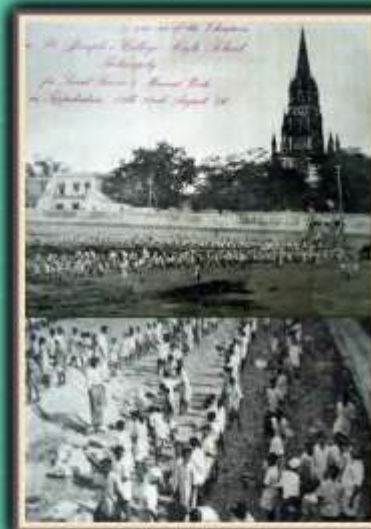
1976 - The Science and Humanities for Women's Development Programme (1976-1980) introduced as an extension department