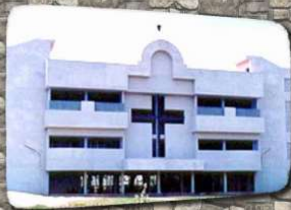
1997 - Johnnie Building was opened.