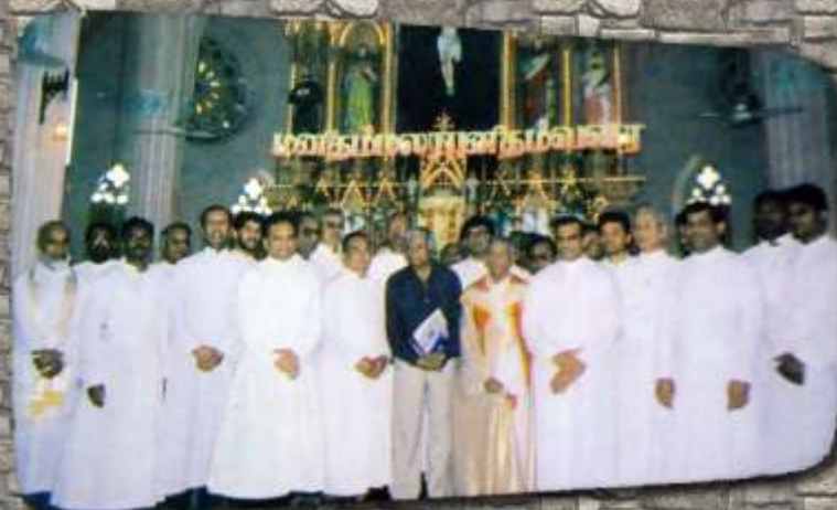
2003 - Illustrious alumnus H.E. Dr. A. P. J. A. Kalam, President of India visited the campus.