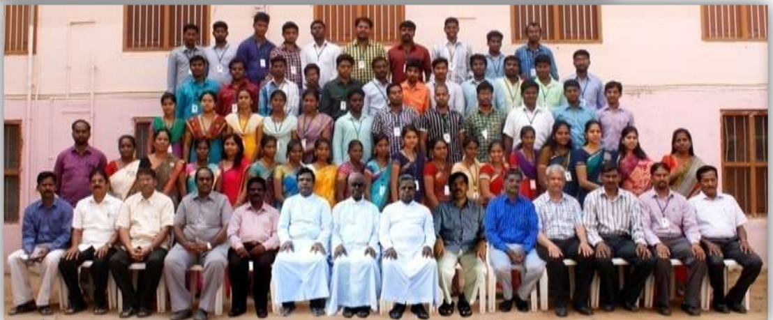
MA English (Shift-I) (2013-15)