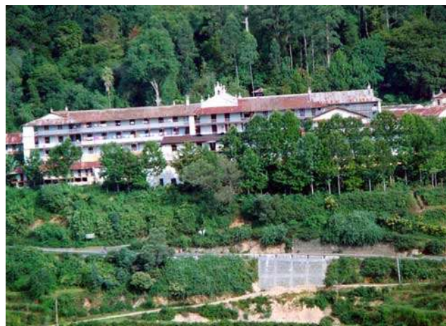
The Anglade Institute of Natural History (AINH) The Sacred Heart College, Shembaganur, Kodaikanal

carbon pool, in Tamil Nadu – Phase II which forms the all India coordinated Research Project.