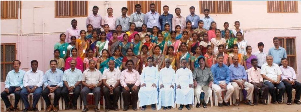
M.Phil. CS (2014-15)