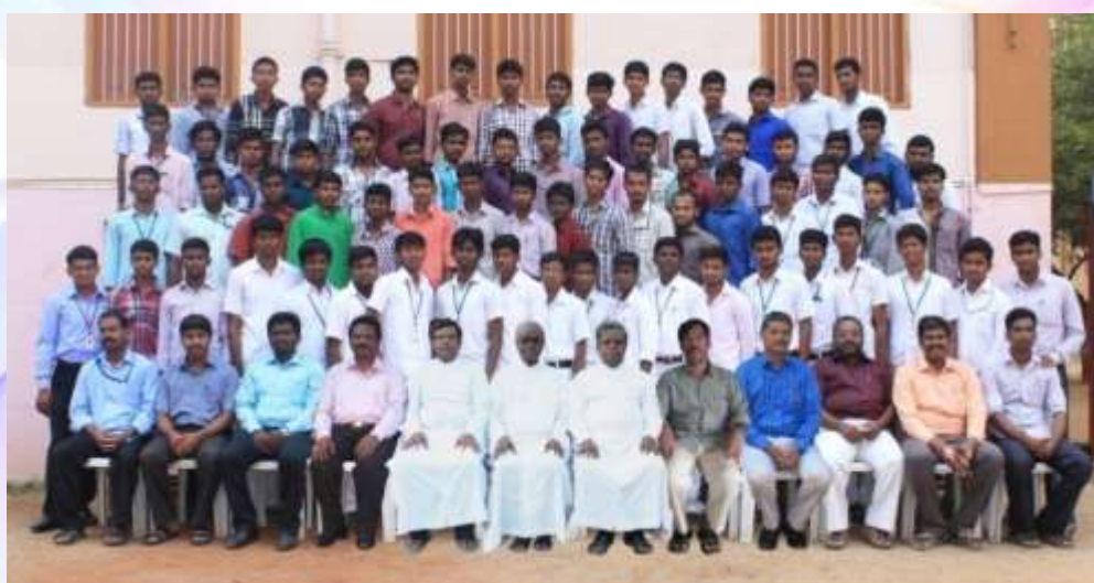
National Service Schemes