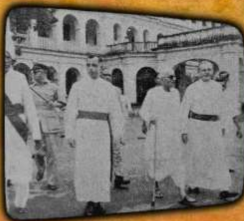
1938 - Hon'ble Governor General Sir C. Rajagopalachari visited.