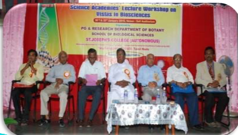
Science Academies' Lecture Workshop on Vistas in Biosciences