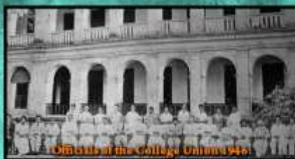
Officials of the College Union in 1946