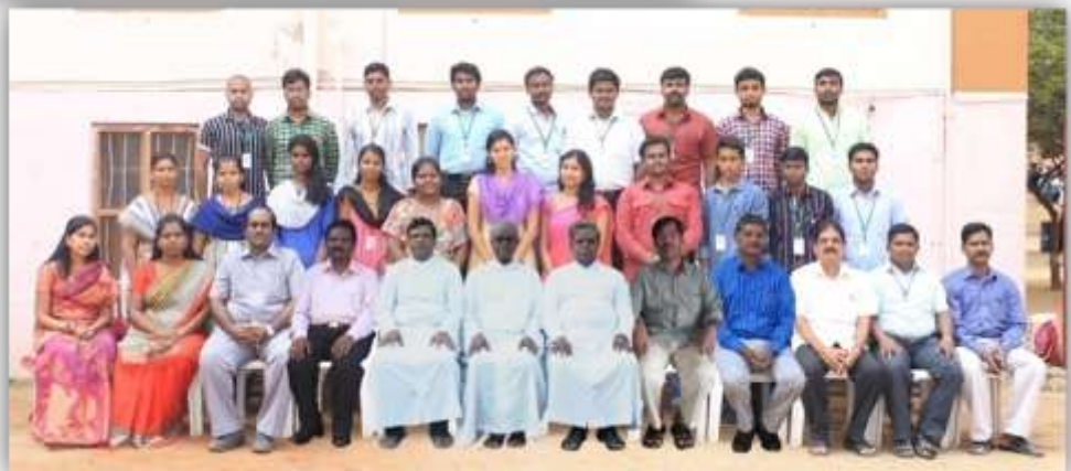
Bibliophile Club (2014-15)