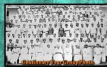
Choirmaster's Group Photo