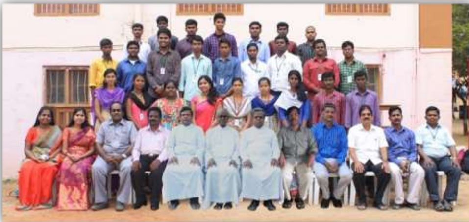
BARD'S Club (2014-15)