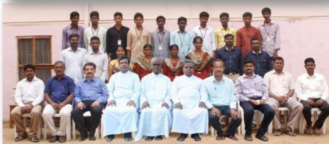
B.Sc. Electronics (2012-15)