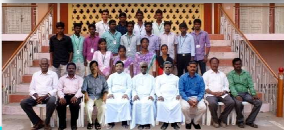
B.Sc. Statistics (2012-15)