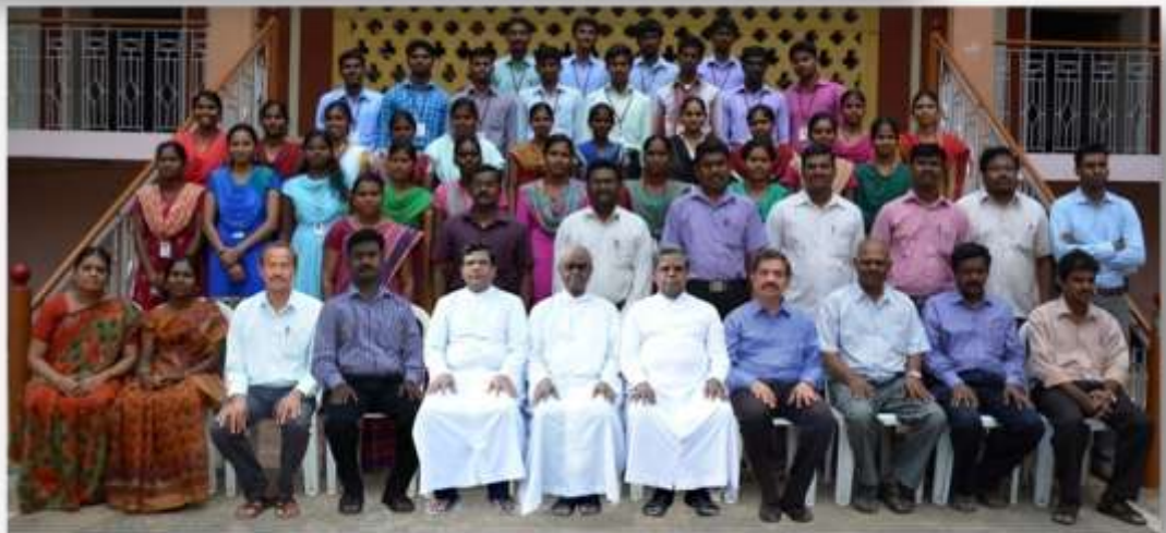
M.Sc. Comp. Sci. (Shift-II) (2013-15)