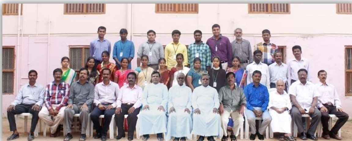
M.Phil. Commerce (2014-15)