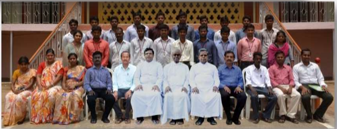
MCA (Shift-II) (2012-15)