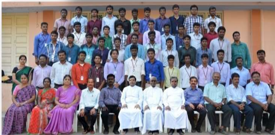
BCA Sec. A (Shift-II) (2012-15)