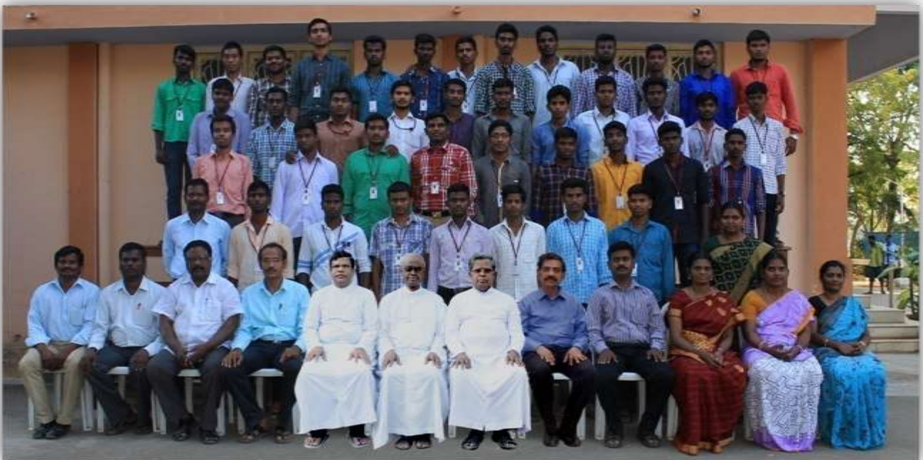
BBA 'B' (2012-15)