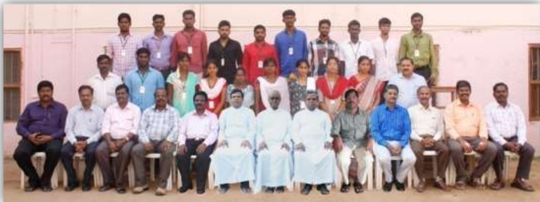
MA Economics (2013-15)