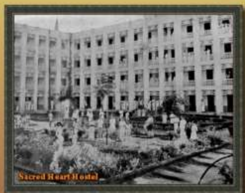
Sacred Heart Hostel