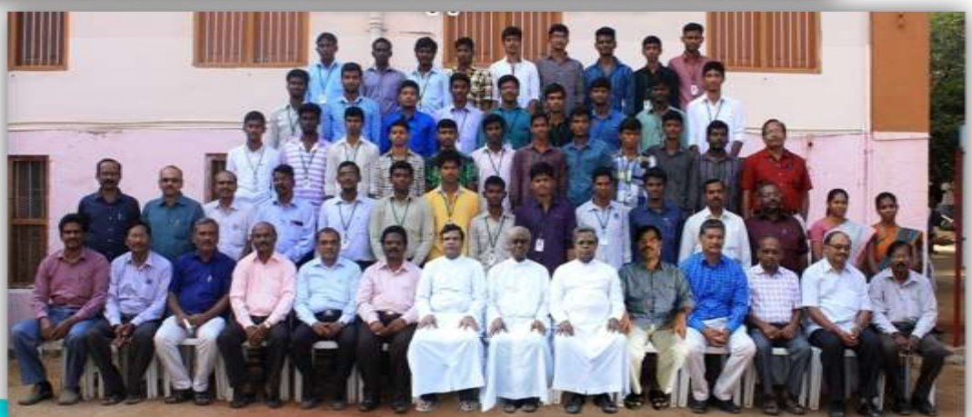
B.Sc. Phys. 'B' (Shift-I) (2012-15)