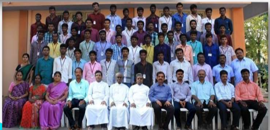
BCA Sec. B (Shift-II) (2012-15)