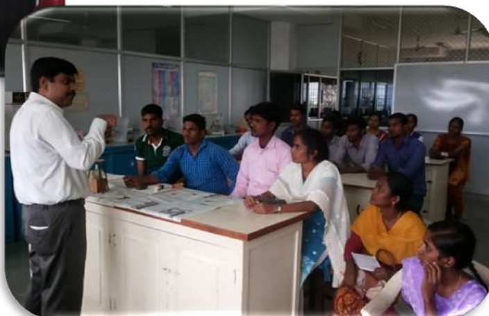
Workshop for Annamalai University Students