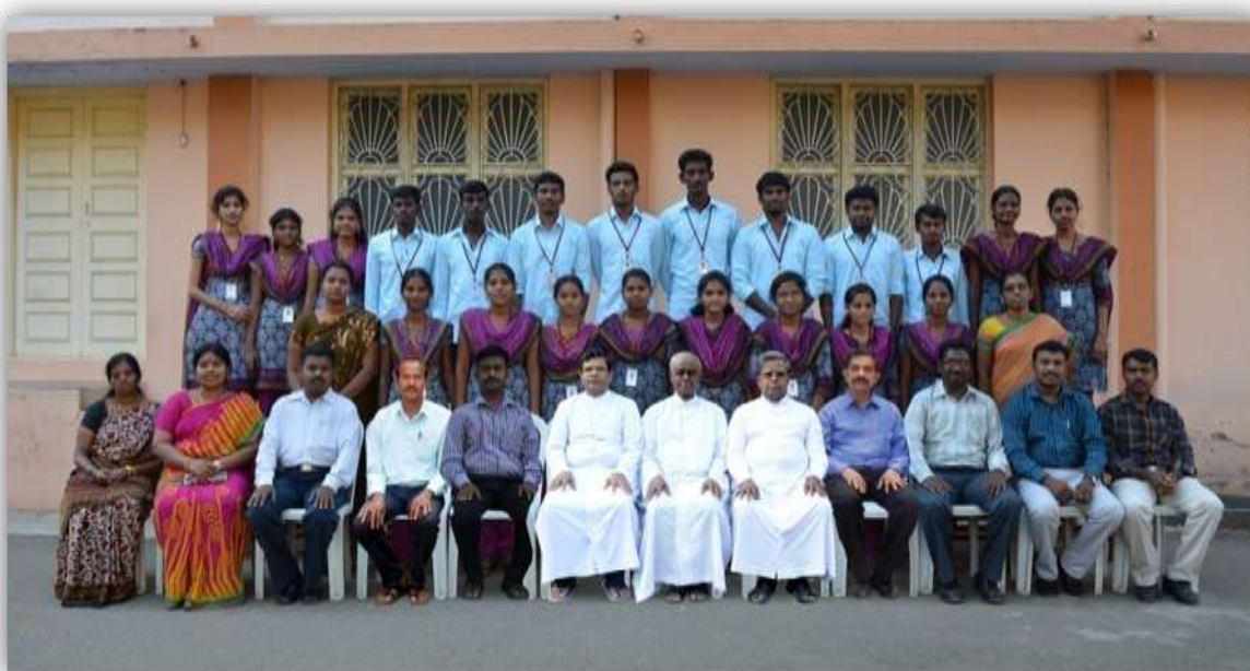
MCom (CA) (Shift-II) (2013-15)