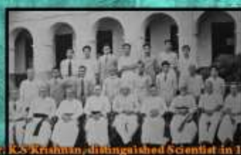
Dr. K.S. Krishnan, distinguished Scientist in 1945