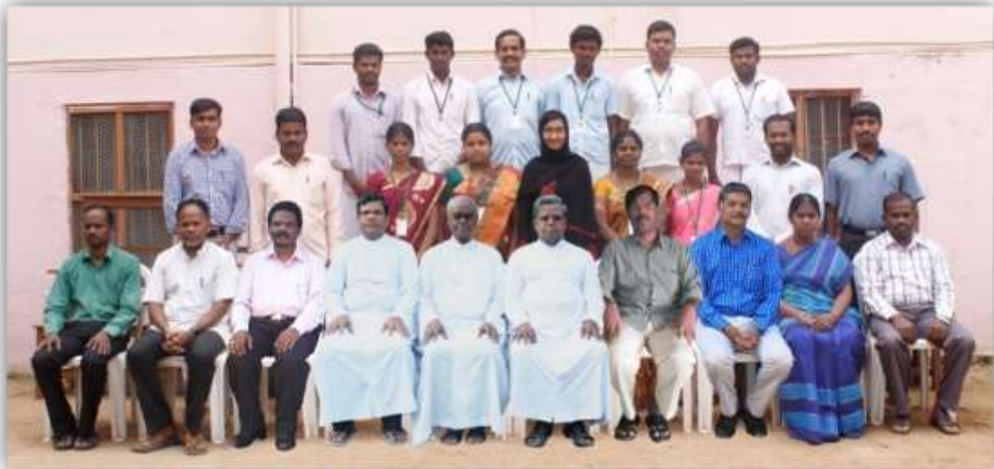
M.Phil. History (2014-15)