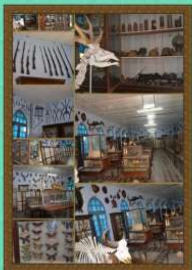
1967 - Rapinat Herbarium was inaugurated.