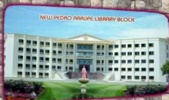
2008 - The five-storied Arrupe Library Building was inaugurated.