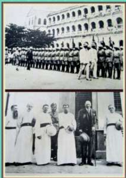
1944 - Centenary celebrations presided over by the Governor, Madras Presidency.