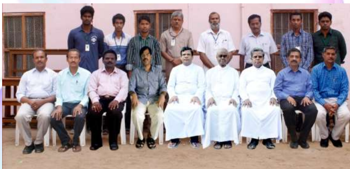
Association Presidents & Secretaries