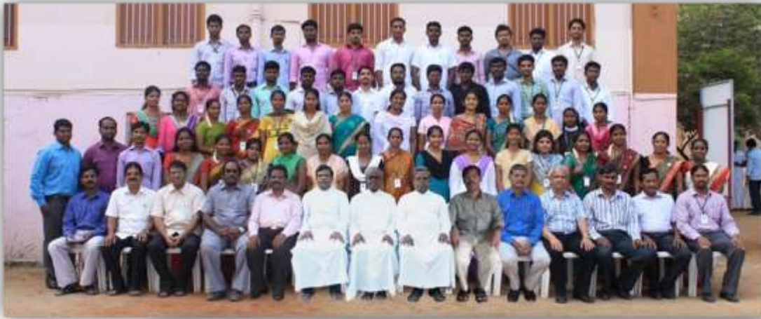
M.Phil. English (2014-15)