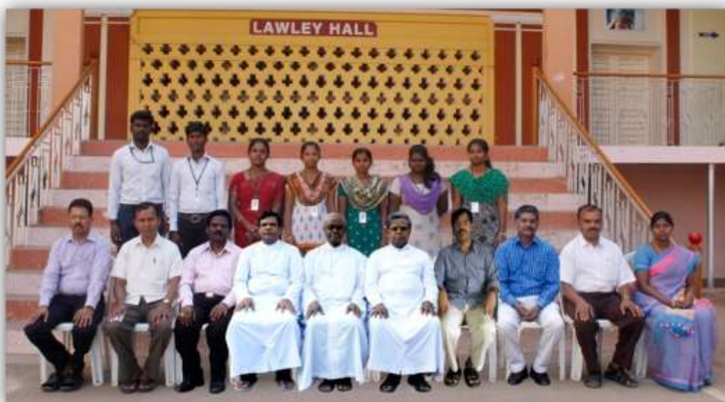
M.Phil. HRM - (2014-15)