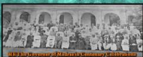
H.E.J. the Governor of Madras in Centenary Celebrations