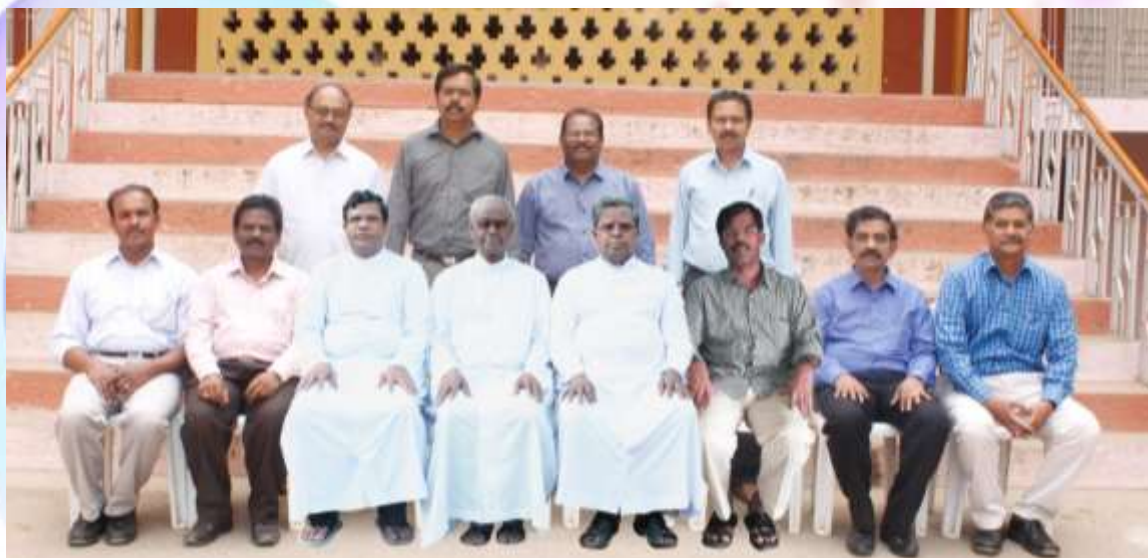
IQAC Committee Members