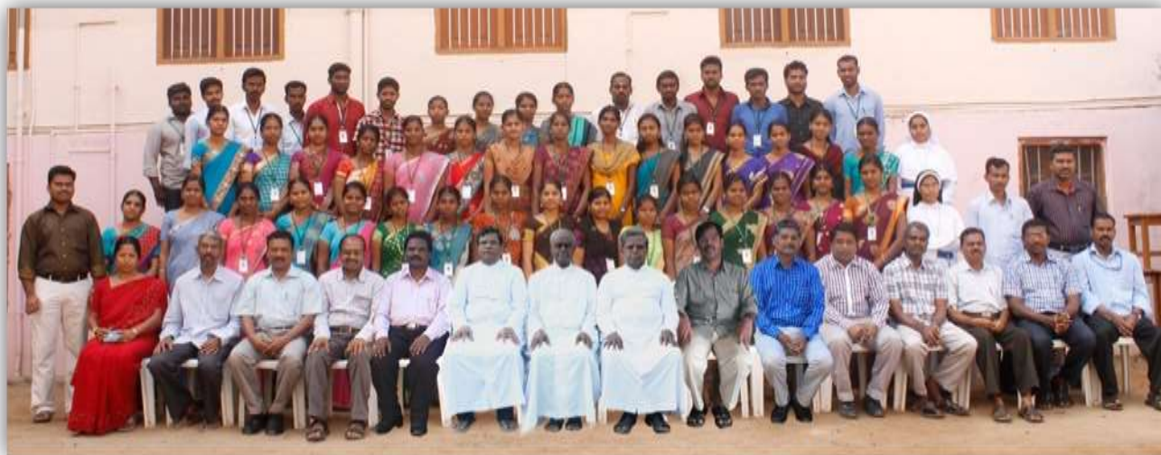
M. Phil. Maths (2014-15)