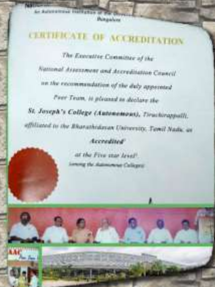
College Accredited by NAAC at A+ Grade in 2007 (Cycle-II) & A Grade in 2012 (Cycle-III)