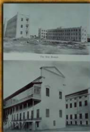
1939 - Lawley Hall Extension and hostel Building were completed.