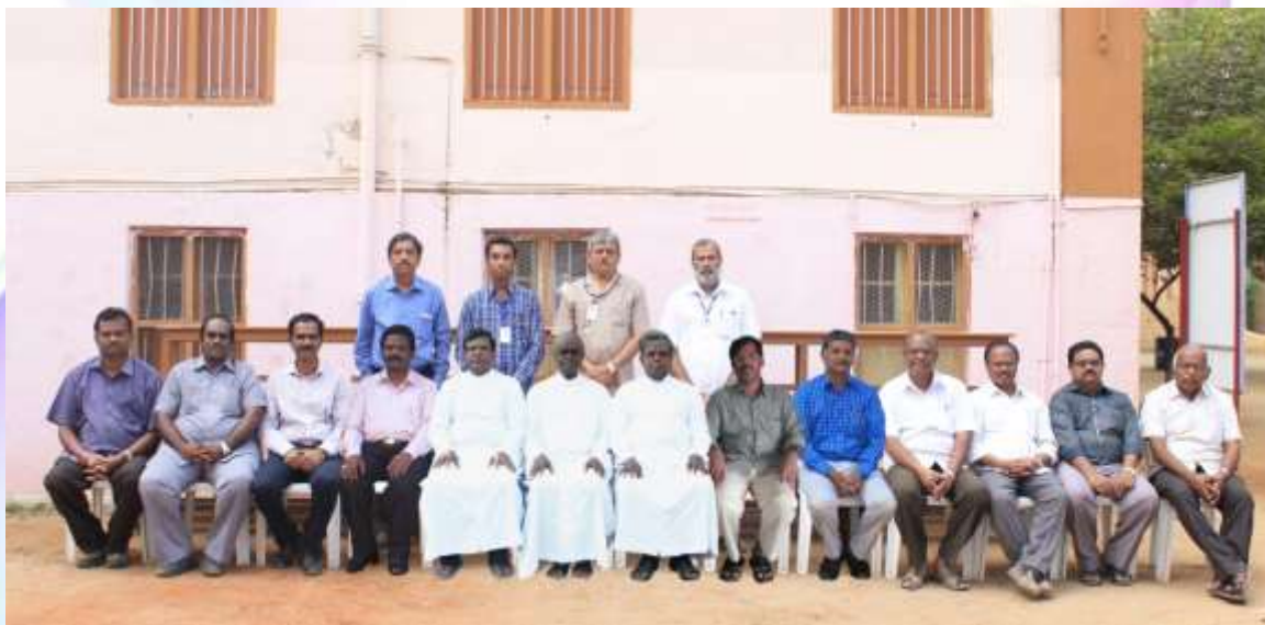
Heads of the Department & Coordinators - Shift-I