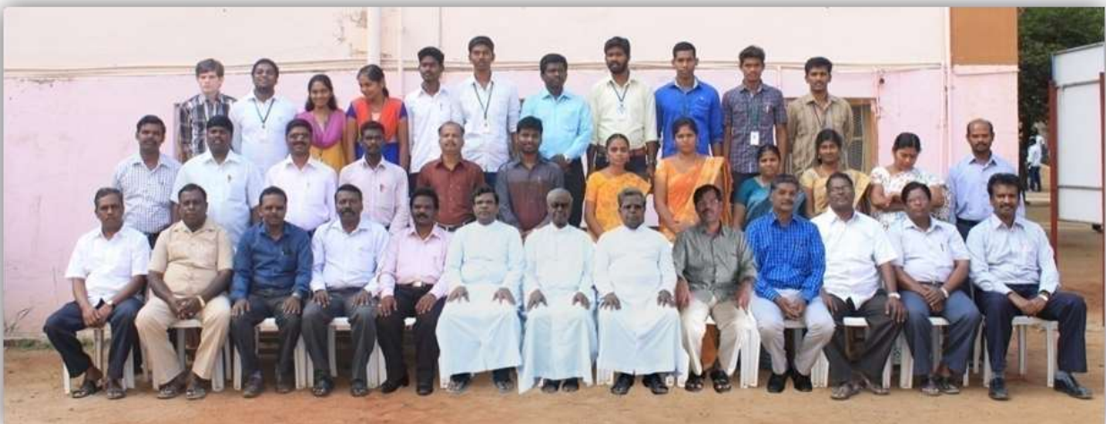
B.A. Tamil (2012-15)