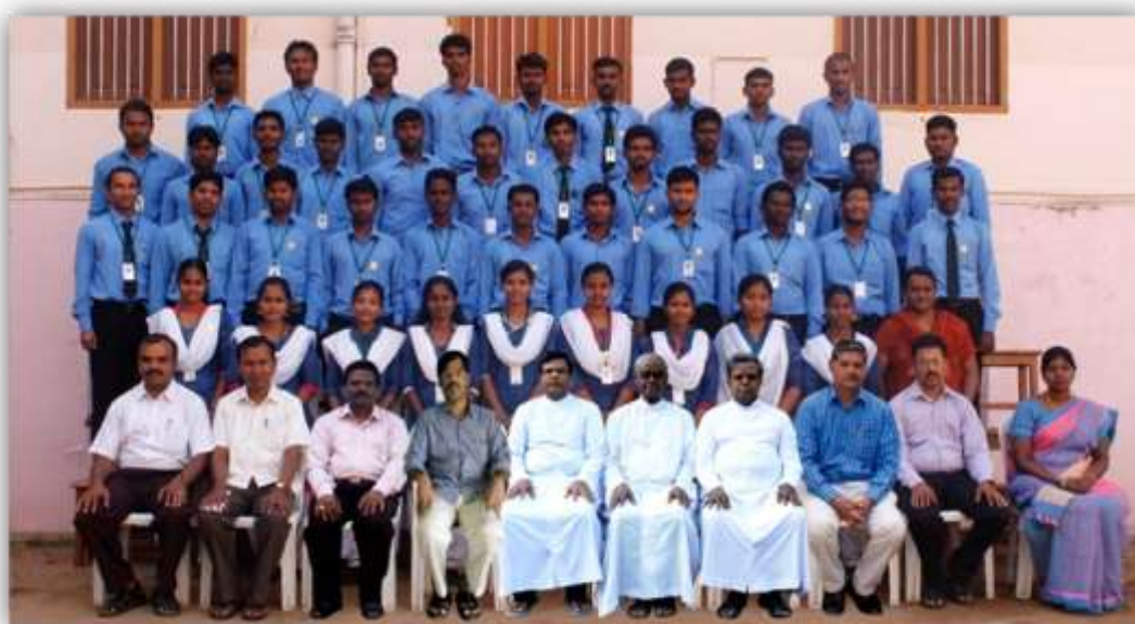
M.A. HRM (2013-15)