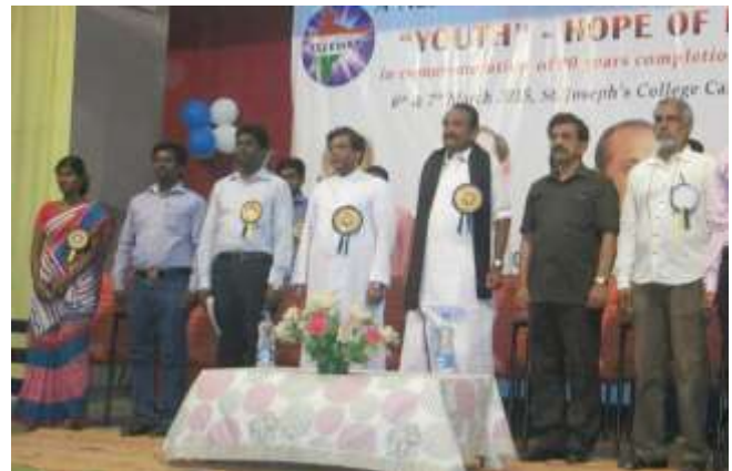
Second day of the Conference created a platform for the students to express their views on "Youth-Yesterday, Today and Tomorrow".