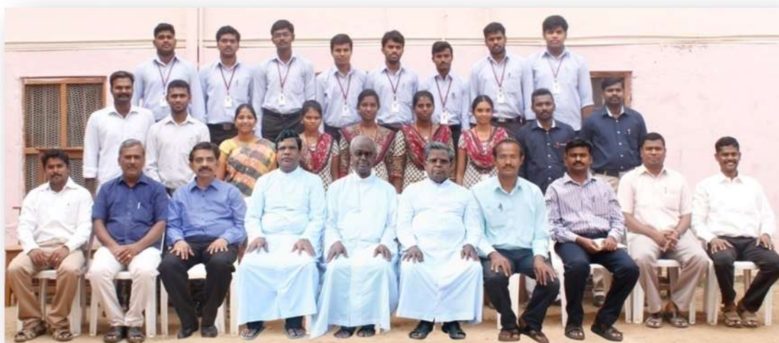
M.Sc. Electronics (2013-15)