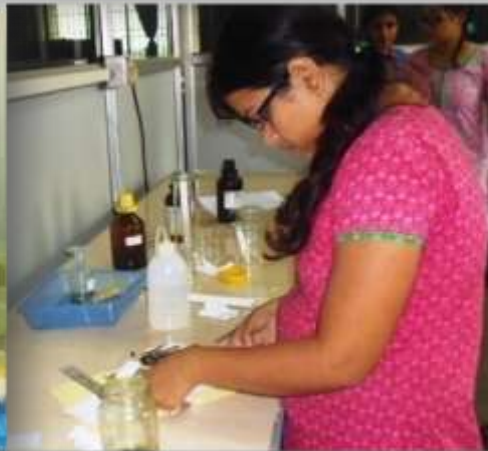
UGC sponsored - Hands on Training