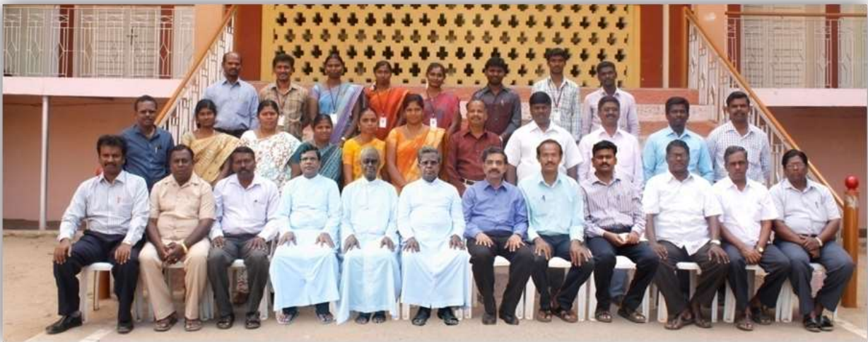
M.A. Tamil (Shift-II) (2013-15)