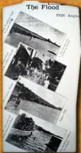
1920 - Flood ravaged the campus.