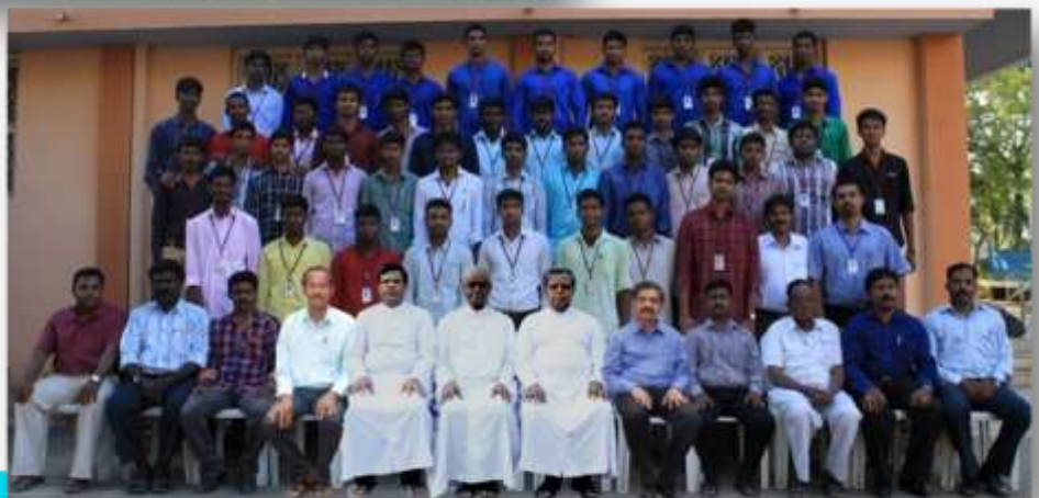
B.Com. 'B' (Shift-II) (2012-15)