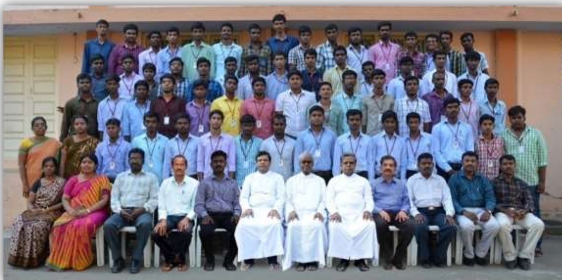
BCom (CA) (Shift-II) (2012-15)