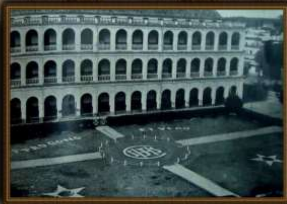
1895 - Preparatory view of Golden Jubilee Celebrations