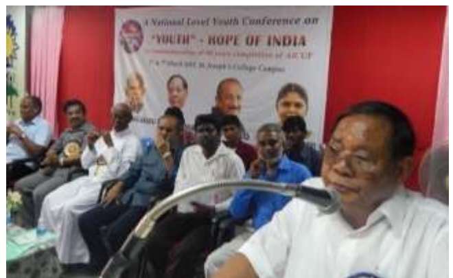
Mr. P. A. Sangma MP, Former Chief Minister of Megalaya and Former Speaker of Lokshaba delivered the valedictory address. He stated that the AICUF was a good platform for him to serve the society. He emphasized the AICUFers and participants of the Conference to be the hope of the Nation by transforming the icons of social change. Around 300 students from various colleges of Tamilnadu and few representatives from Kerala also took part in the Conference.