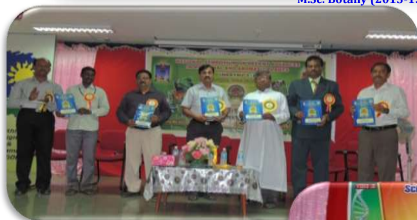
National Symposium on Recent Advances in Medicinal and Aromatic Plants