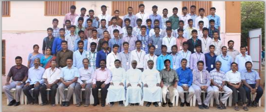
M.Sc. Maths (Shift-II) (2013-15)