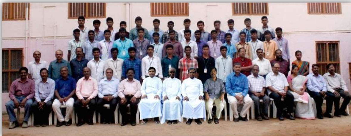
B.Sc. Phys. 'A' (Shift-I) (2012-15)