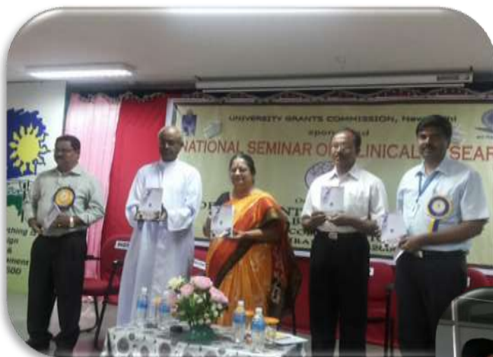
National Seminar on Clinical Research