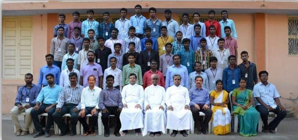
BA English (Shift-II) (2012-15)