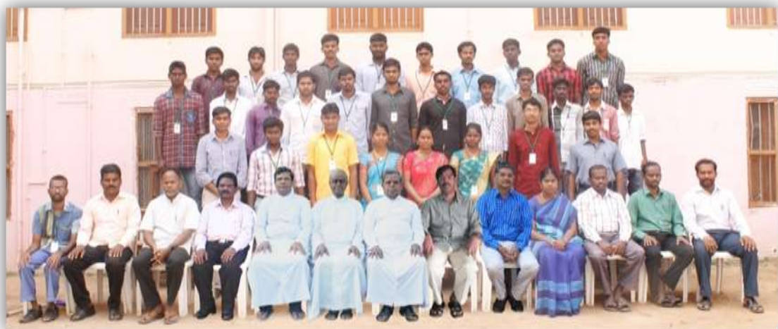
B.A. History (2012-15)