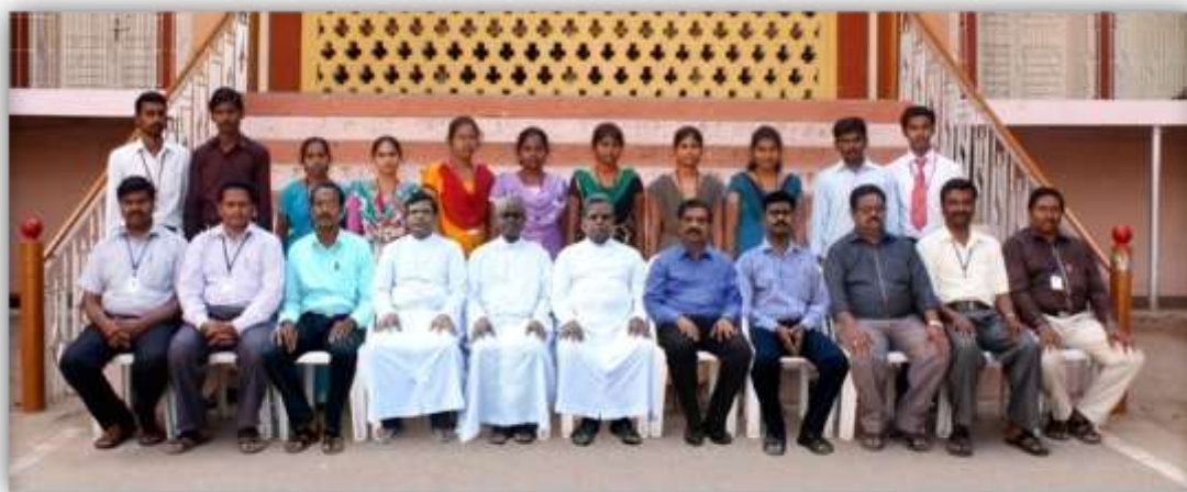
M.Sc. Biochemistry (2013-15)