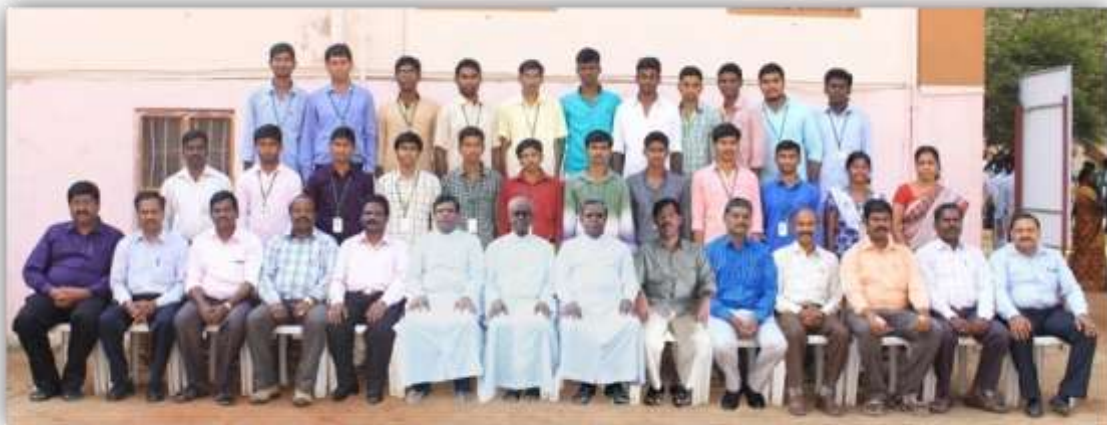
BA Economics (2012-15)