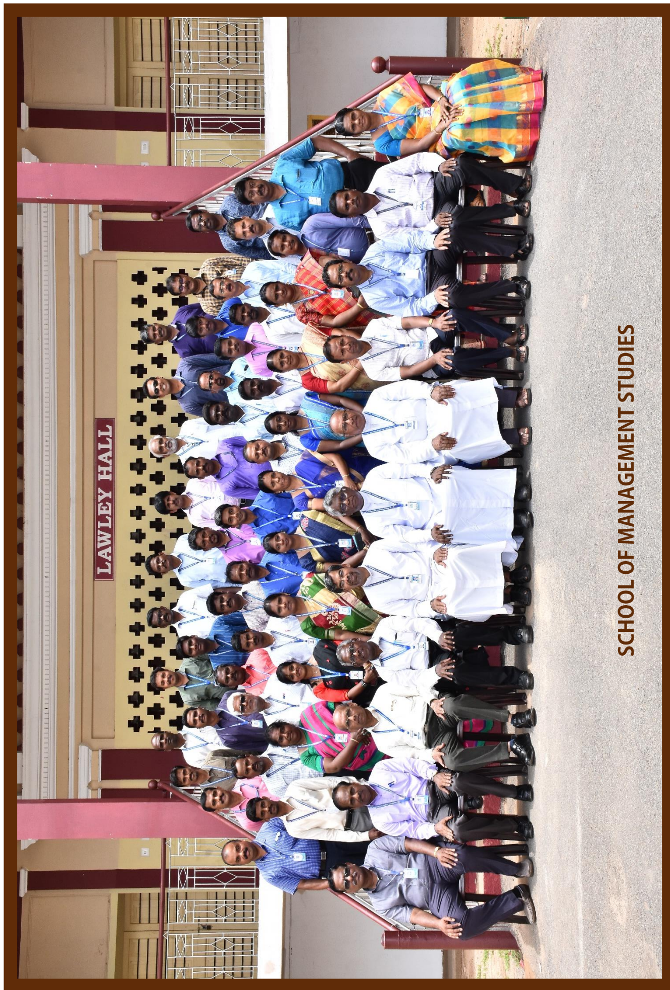
SCHOOL OF MANAGEMENT STUDIES