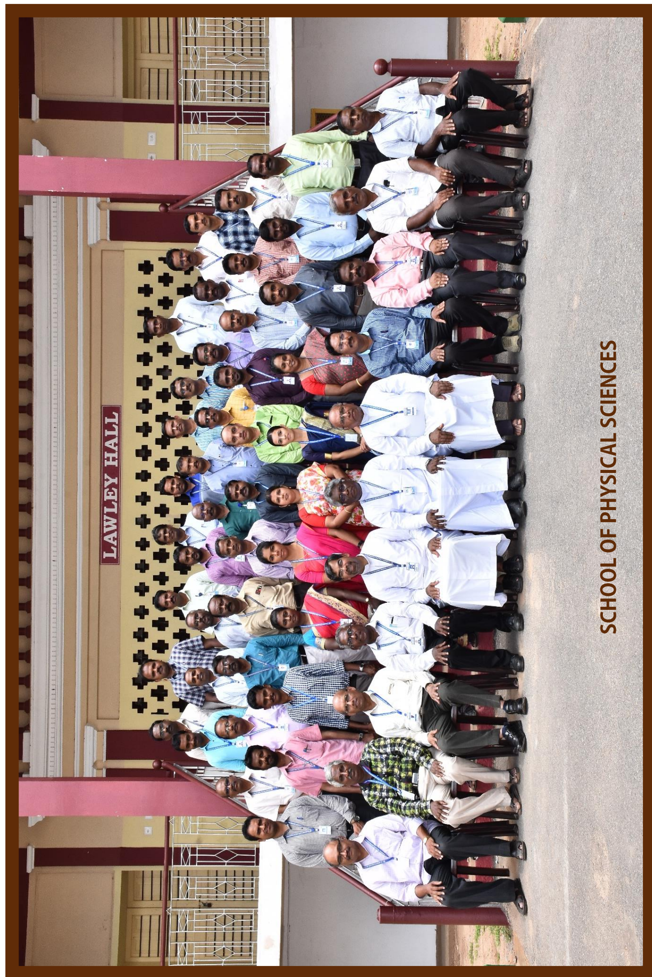
SCHOOL OF PHYSICAL SCIENCES