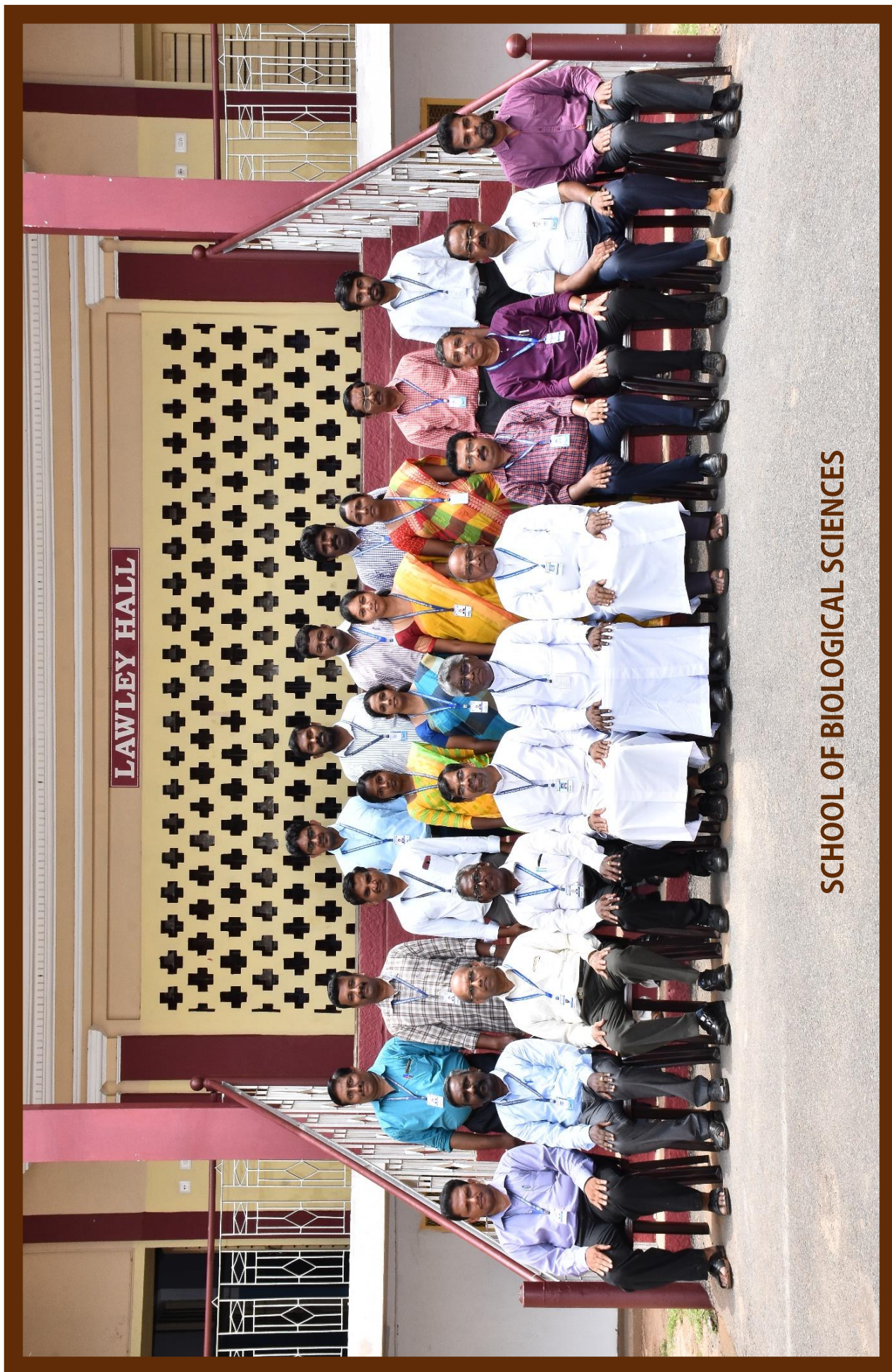
SCHOOL OF BIOLOGICAL SCIENCES