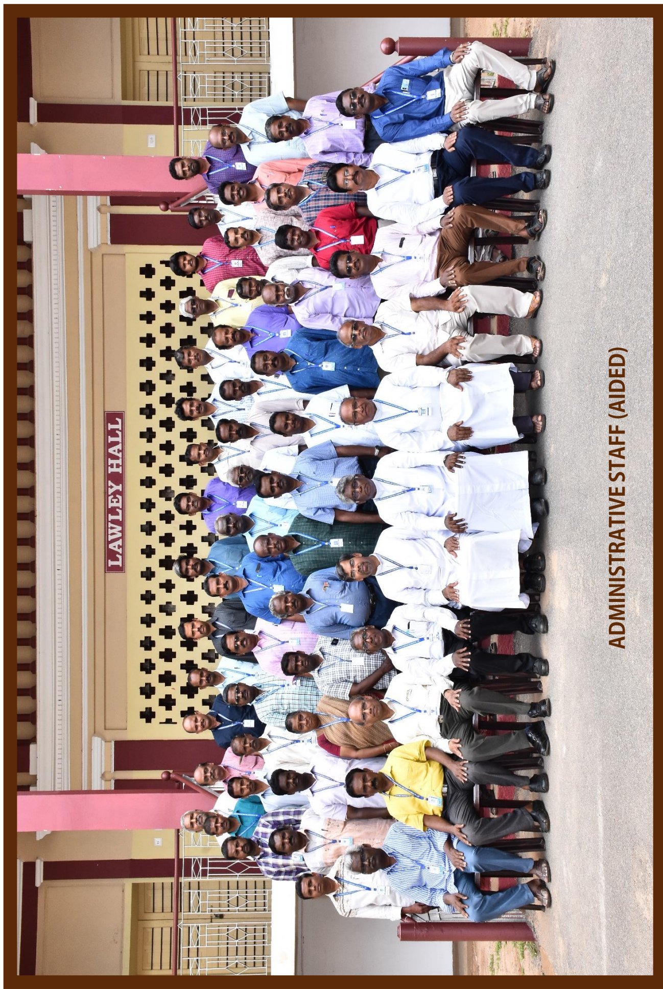
ADMINISTRATIVE STAFF (AIDED)