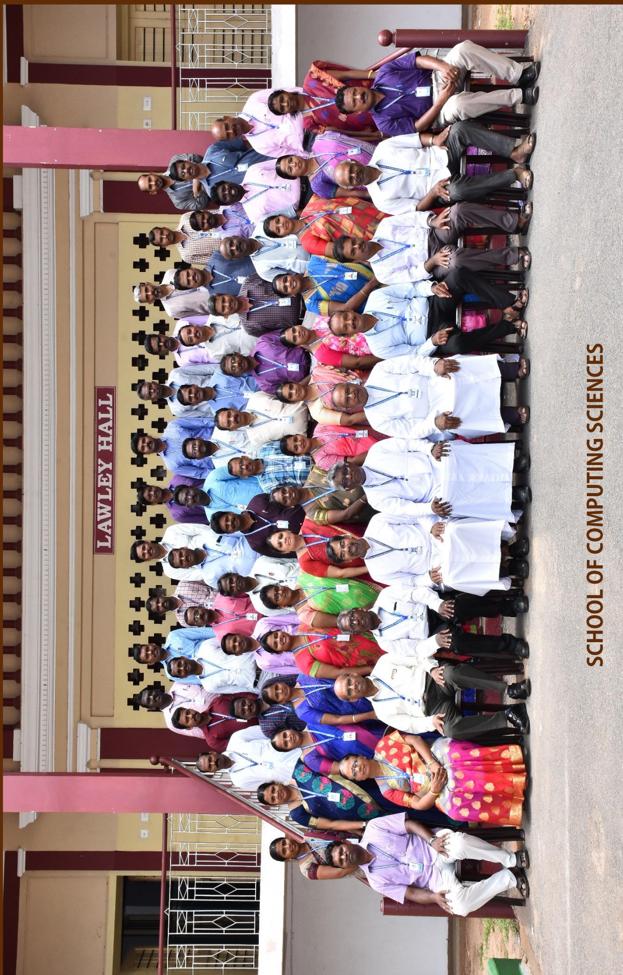
SCHOOL OF COMPUTING SCIENCES