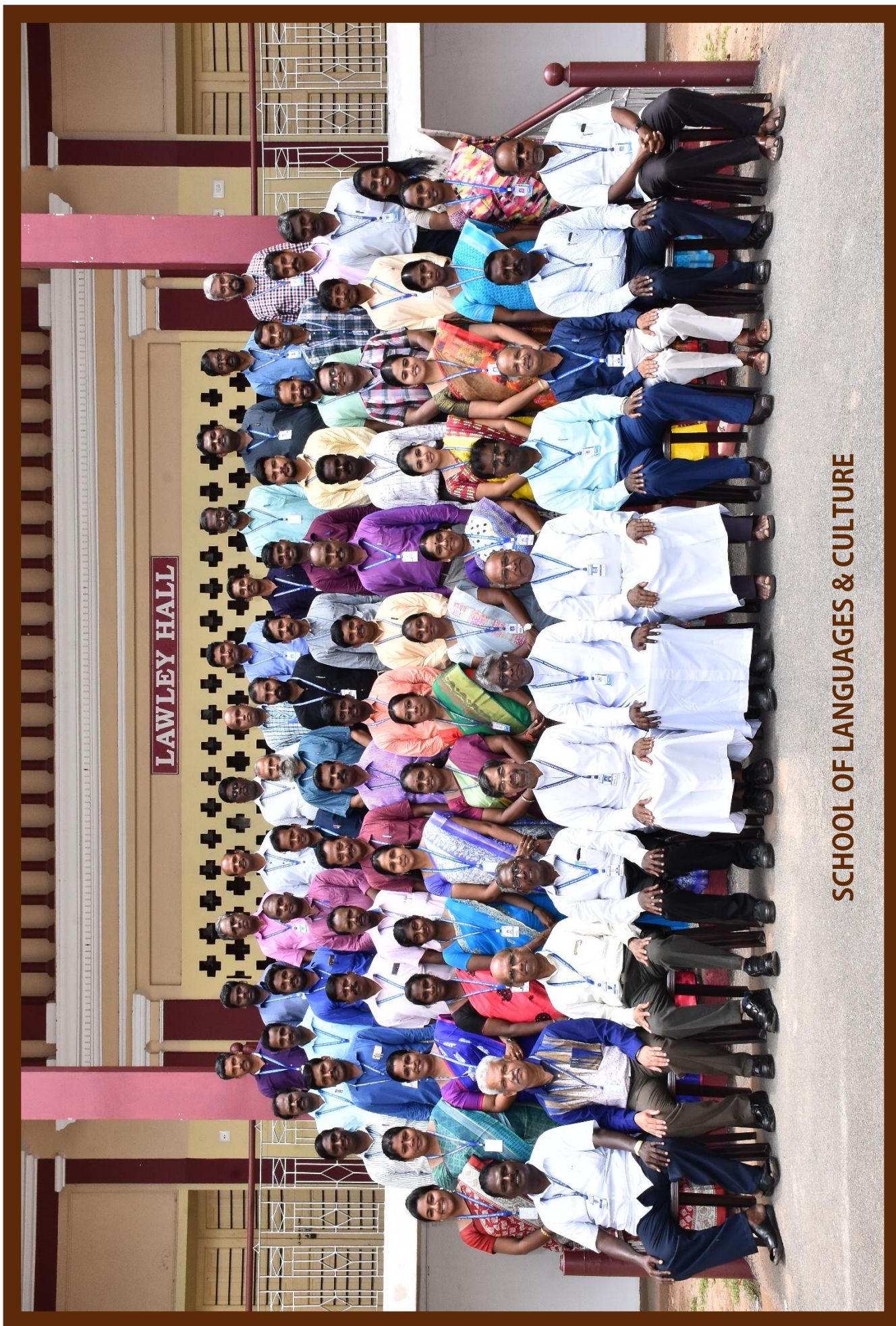
SCHOOL OF LANGUAGES & CULTURE