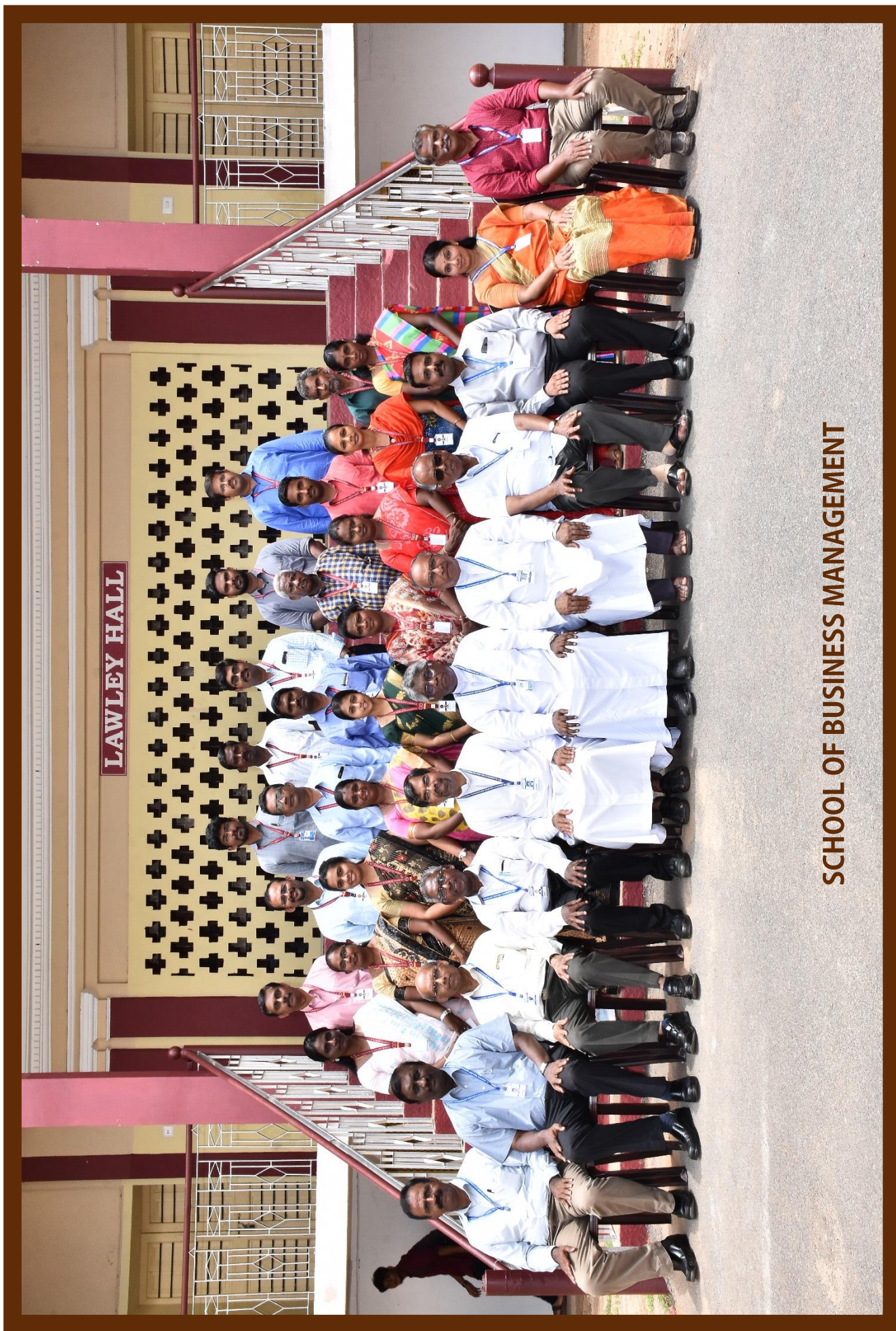
SCHOOL OF BUSINESS MANAGEMENT