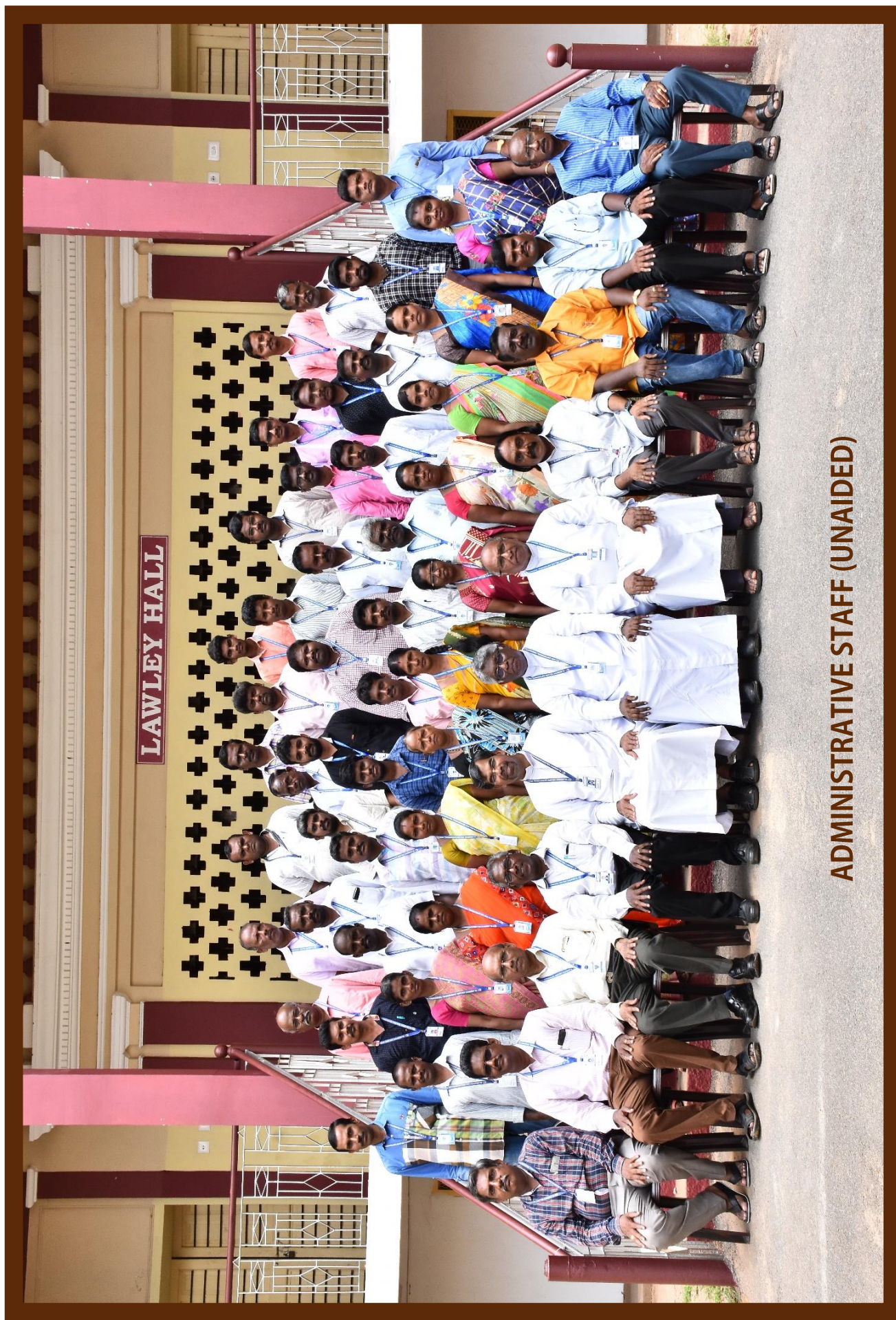
ADMINISTRATIVE STAFF (UNAIDED)